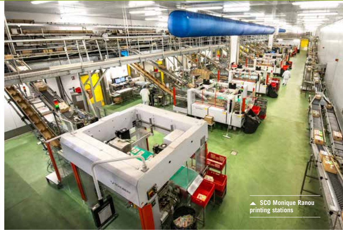
▲ SCO Monique Ranou printing stations