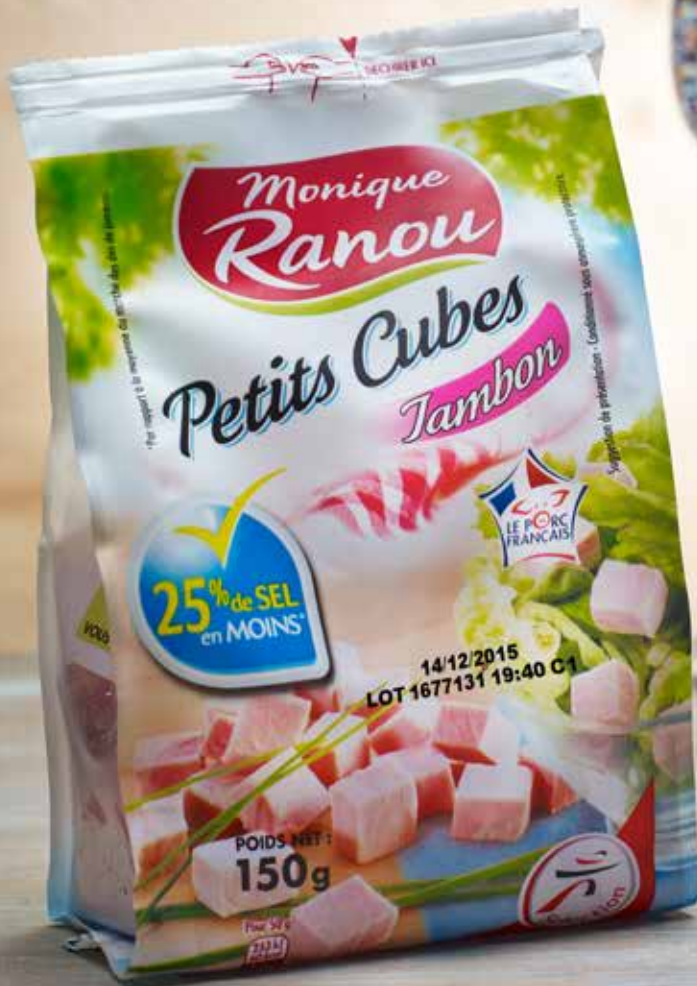
▲ Diced ham sachets coded with SmartDate X40