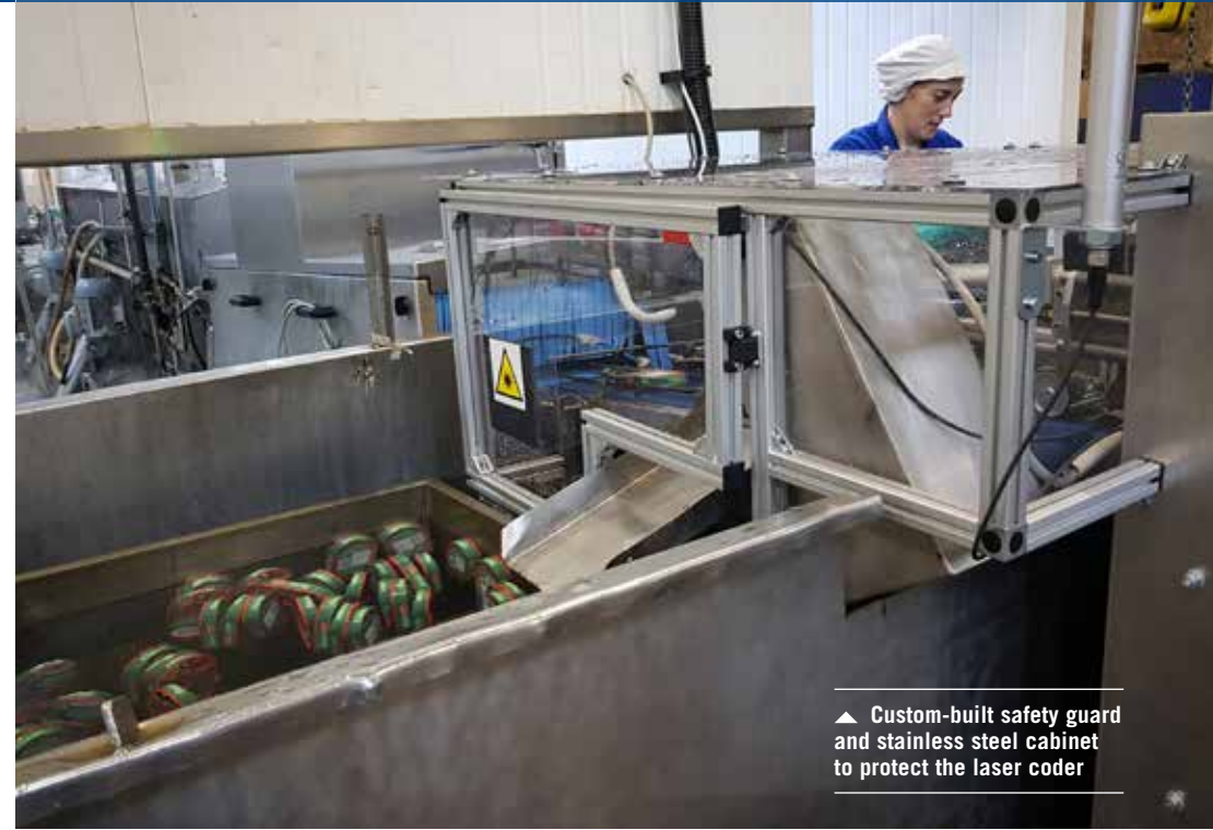
▲ Custom-built safety guard and stainless steel cabinet to protect the laser coder