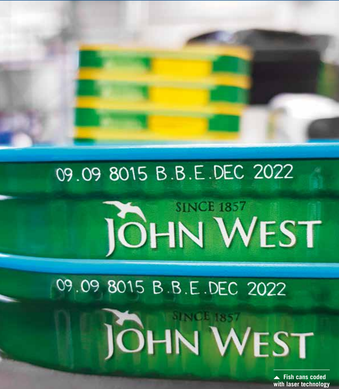
▲ Fish cans coded with laser technology